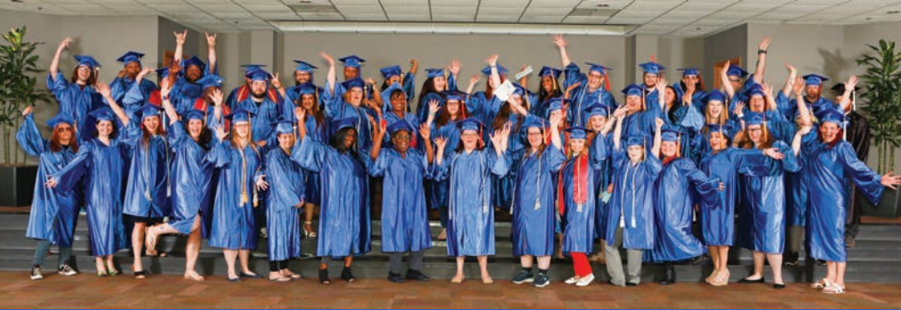
Wichita 2020 Graduates