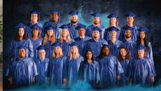
Topeka 2020 Graduates